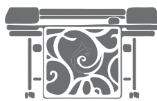
▶ Wide Format Systems