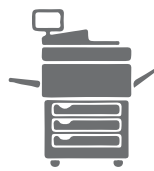
▶ High-end Digital Printing