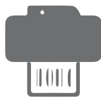
▶ Labels & Packaging