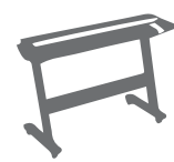
▶ Engineering Systems